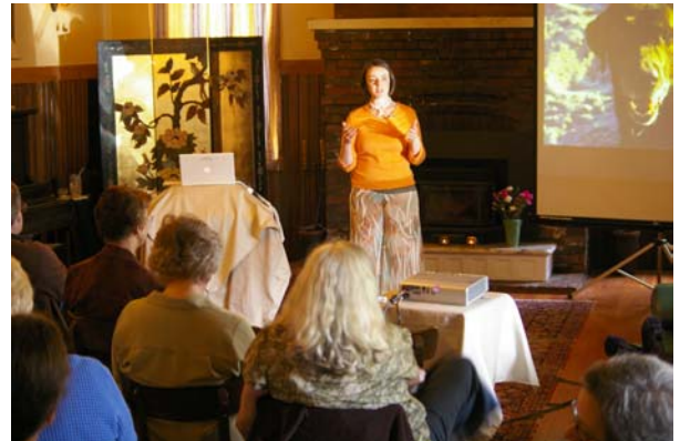
In 2008 the spirits in Transition seminar took place in 6 locations in 5 different states.