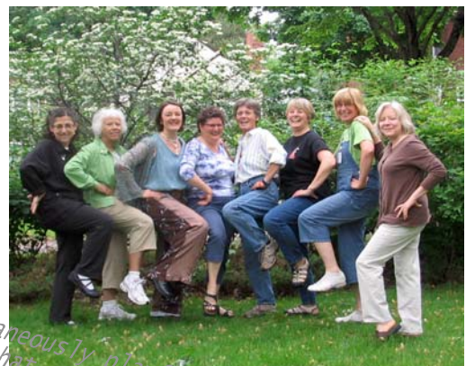
Spontaneously playful participants show that a seminar on animal hospice can also be fun.