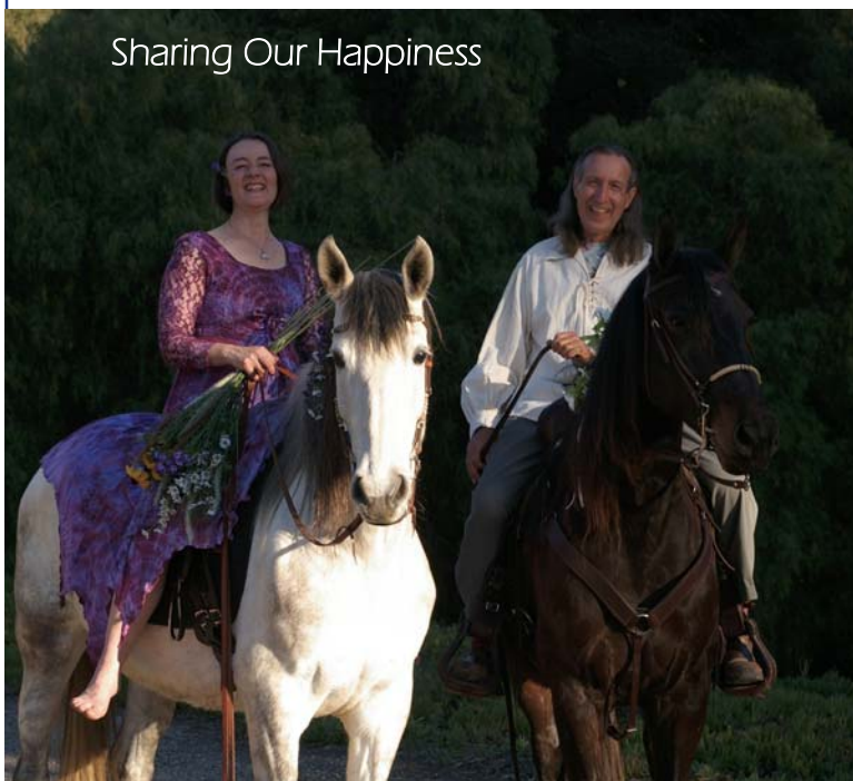
Sharing Our Happiness

As a next step towards the goal of making educational resources on animal hospice easily accessible, the first ever online class on the topic will be offered by SPIRITS in Transition starting this spring. Wherever you are, you can learn in your own pace much of what is contained in the weekend seminar.